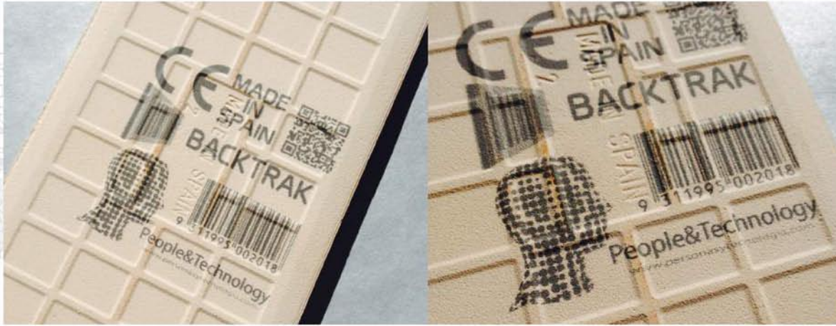
Print detail made with BACKTRACK